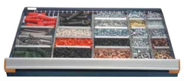
400 lb capacity - 100% extension

The Rousseau drawer has significant advantages: The drawers are available in 10 heights with a 400 lb. capacity per drawer and 100% access to drawer contents. In addition, there is a Lifetime Warranty on the rolling mechanism.