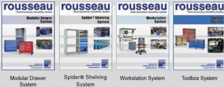
Modular Drawer System